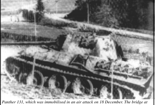
Cheneux is visible in the background.

In the afternoon of the 21st, the 1/119th Infantry again tried to capture the St. Edouard Sanitorium, to no avail. Also that afternoon, Task Force Jordan and the 3/119th Infantry used forest tracks to move through the woods north of Stoumont. Reaching the edge of the trees, German tanks prevented further progress. Peiper's greatest danger at Stoumont that day came from the fresh 2/119th Infantry, moving cross country through the Bois de Bassenge to cut the N.33 near the St. Anne Chapel, only 800 yards from Peiper's HQ. The Germans soon pushed back the American roadblock, but this new threat coupled with the fierce American artillery fire pouring into Stoumont prompted Peiper to order a withdrawal to La Gleize. This was accomplished without incident after dark. However, Kampfgruppe Peiper was now surrounded, low on supplies and in a defensive posture, nothing like the threatening armoured spearhead of two days before.